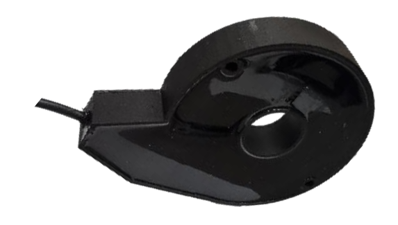
Weatherproof HFCT 50