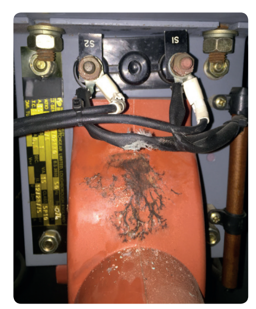
Figure 1: Electrical treeing on CT

If the CT had not been replaced, it would have failed; at best the failure could have been the single 11kV switch tripping resulting in many weeks of press down time while a new CT was sourced, at worst it could have led to a fire resulting in multiply presses being out of action due to substantial switchgear damage.